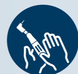
Inspection and maintenance

Designed to give you the best. The best performance in a simple and fast work-flow. An innovative thermal disinfectant that replaces the numerous manual tasks typical of the stages preceding sterilization, thus reducing the workloads. Equipped with the optional HMD accessory, Tethys H10 extends the reconditioning process to rotating instruments, resulting in unparalleled performance.